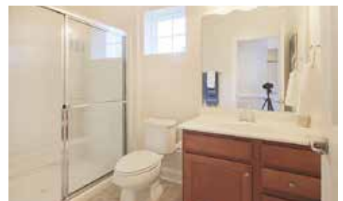
Full Bathroom (Main)